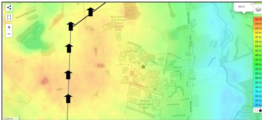
MAP A— RELIEF MAP OF BROOMFIELD PARISH